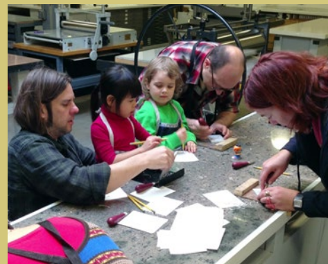
Free Ink Day Fans!

Highpoint's Education & Community Programs experienced a flurry of activity this fall with new partnerships and grant projects, community events, and another productive session of the ACCESS/PRINT Project mentorship program for teens.