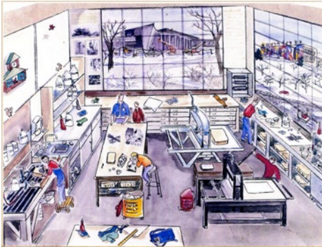
Lisl Gaal Old Studio Arts 170 Lithograph with watercolor, 2003