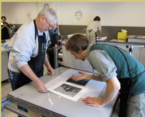
Partnering with Veterans in the Arts