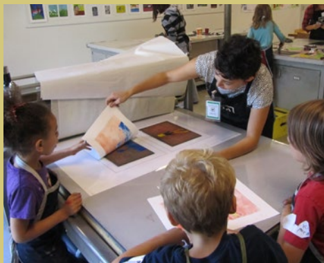
Monoprinting with school partners