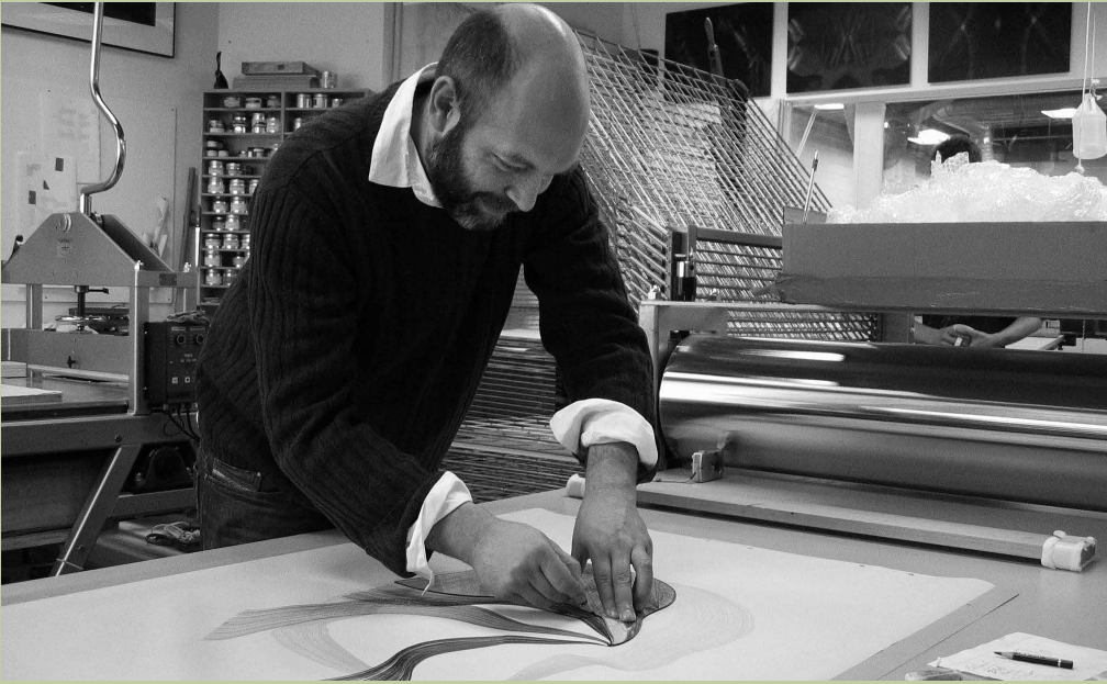
Artist Carlos Amorales at work in Highpoint's studio.