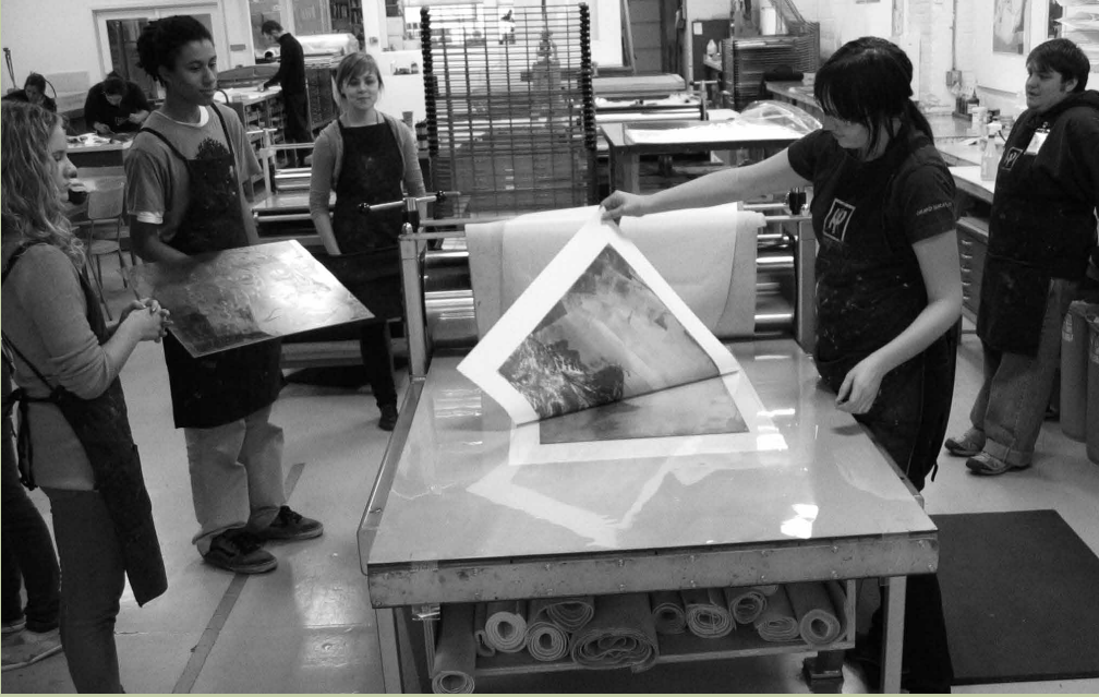
Pulling a monoprint