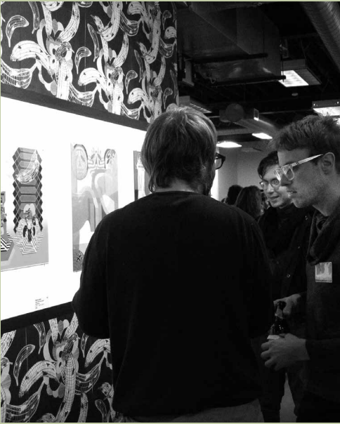
Opening night at HP for the 2008-09 Jerome Emerging Printmakers